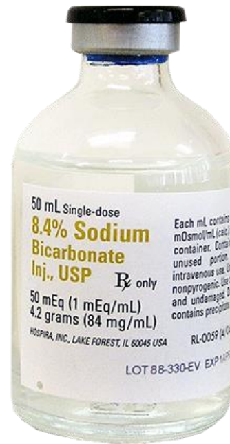
One vial of 8.4% Sodium Bicarbonate, available in 50mL and 10mL vials