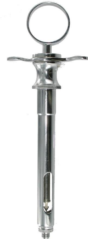
Local anesthetic cartridge and self-aspirating dental syringe