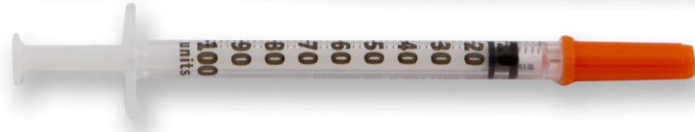
Two 1mL insulin syringes (eg, Terumo® 1mL, 29ga, ½")