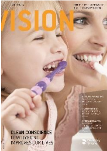
Fig. 1: The current edition of the Dentsply Sirona's customer magazine, VISION, provides interesting and entertaining information on the subject of hygiene.